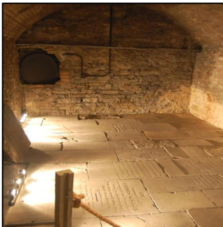
Undercroft paved with old grave markers