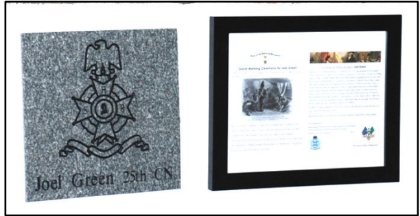
Granite Marker placed in undercroft of St. Francis Seraph