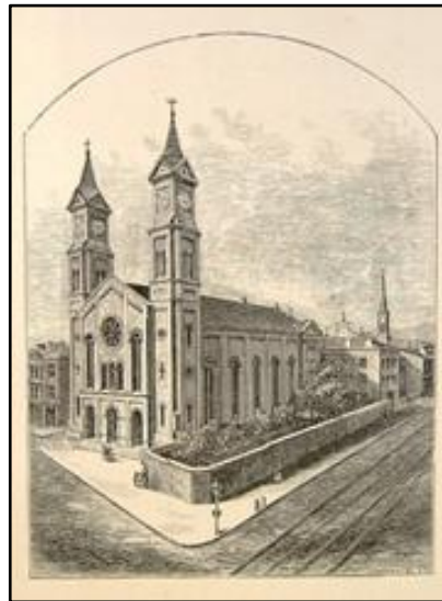
St Francis Seraph Church, 1859