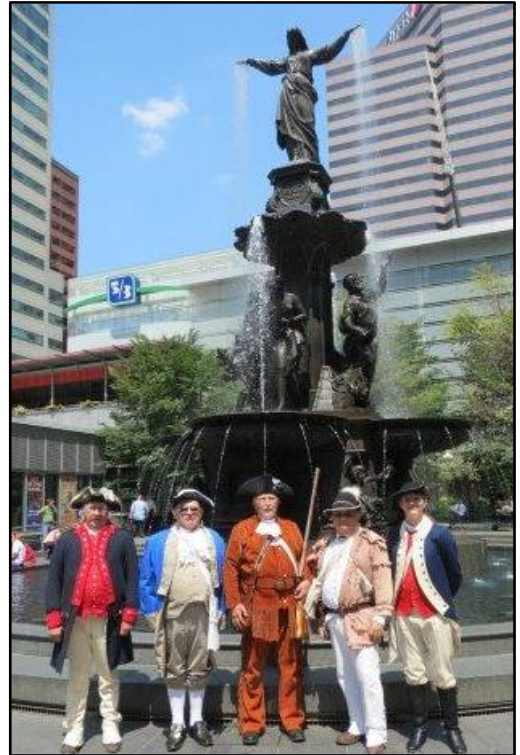
Tyler Fountain, downtown Cincinnati, Ohio