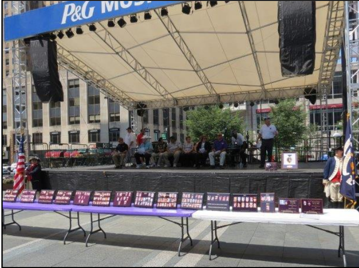
Cincinnati Chapter Honor Guards in place at Fountain Square

* On August 4 th , the Nolan Carson Color Guard presented the colors and stood guard during the Purple Heart Day ceremony on Fountain Square, downtown Cincinnati. Compatriot guards stood at either side of the stage during the service with the National Colors on the right and the Military Order of the Purple Heart flag on the left. They presented the National Colors for the Pledge of Allegiance and for Taps.