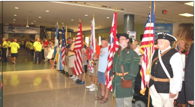
See if you can find six Cincinnati SAR Chapter Compatriots in uniform, at the Greater Cincinnati Airport.