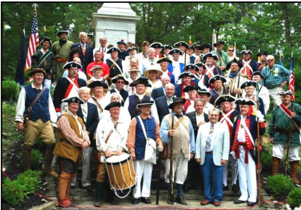
Battle of Blue Licks Commemoration, 2014