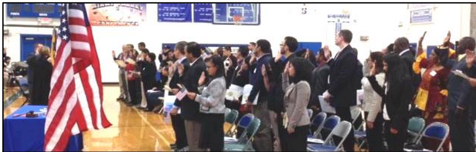
Summit Country Day School hosted the October 24 th Naturalization Citizenship Ceremony