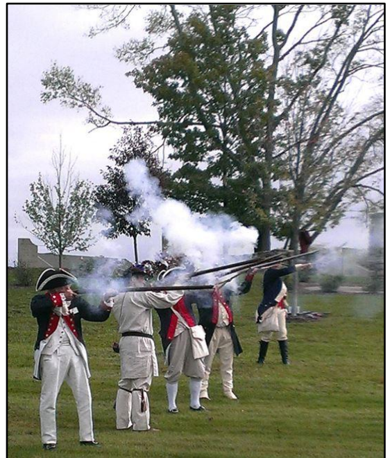
Flintlock Musket salute at the Woodmansee Sugar Valley Farm Cemetery (1818-1887)