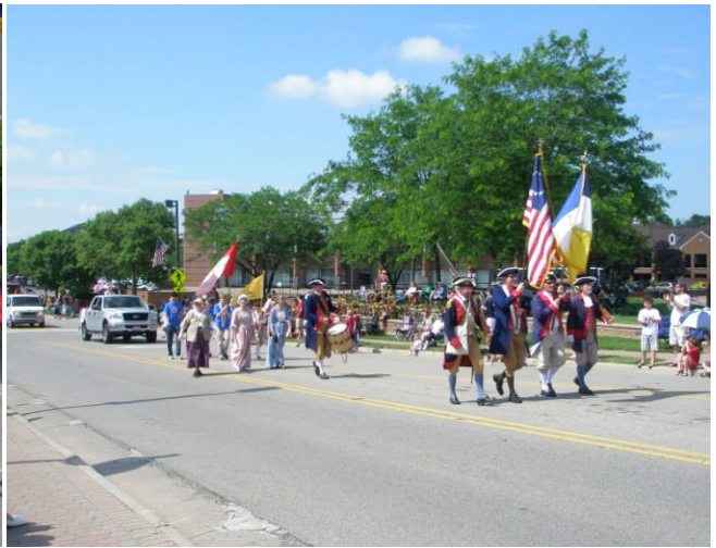
Scenes during the 2010 Blue Ash 2010 Memorial Day Parade