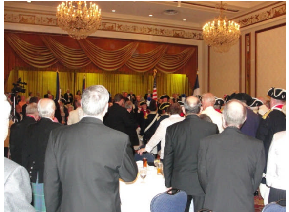
Retiring the Colors at second evening banquet