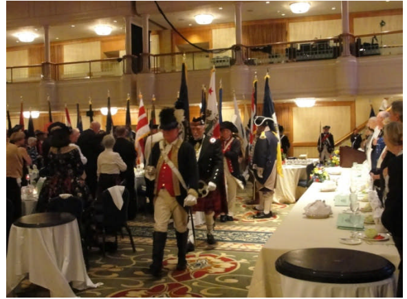
Parade of Colors at first evening banquet