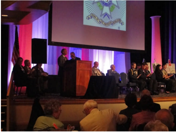
Youth Awards Luncheon stage