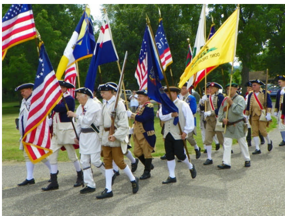
Combined OHSSAR Color Guard on the march