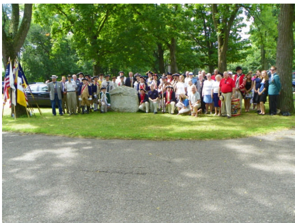
Assembled DAR, C.A.R. and SAR participants