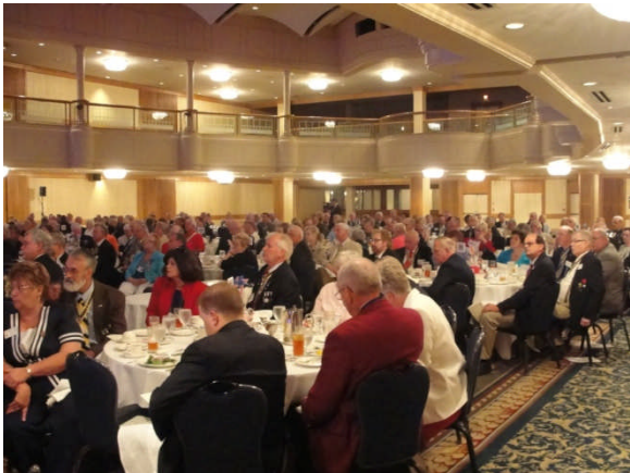
Youth Awards Luncheon attendance