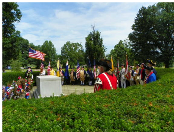
Tomb of the Unknown Revolutionary War Soldier